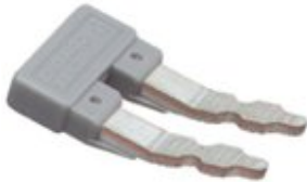
Insertion bridge, pitch: 8 mm, color: gray

Please be informed that the data shown in this PDF Document is generated from our Online Catalog. Please find the complete data in the user's documentation. Our General Terms of Use for Downloads are valid ( http://phoenixcontact.com/download )